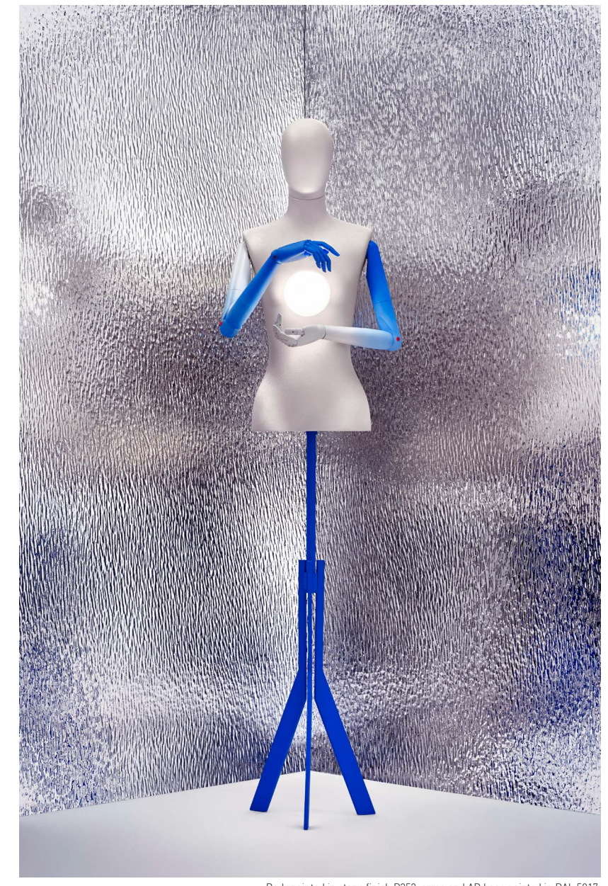
Body painted in stone finish P252, arms and AD base painted in RAL 5017.